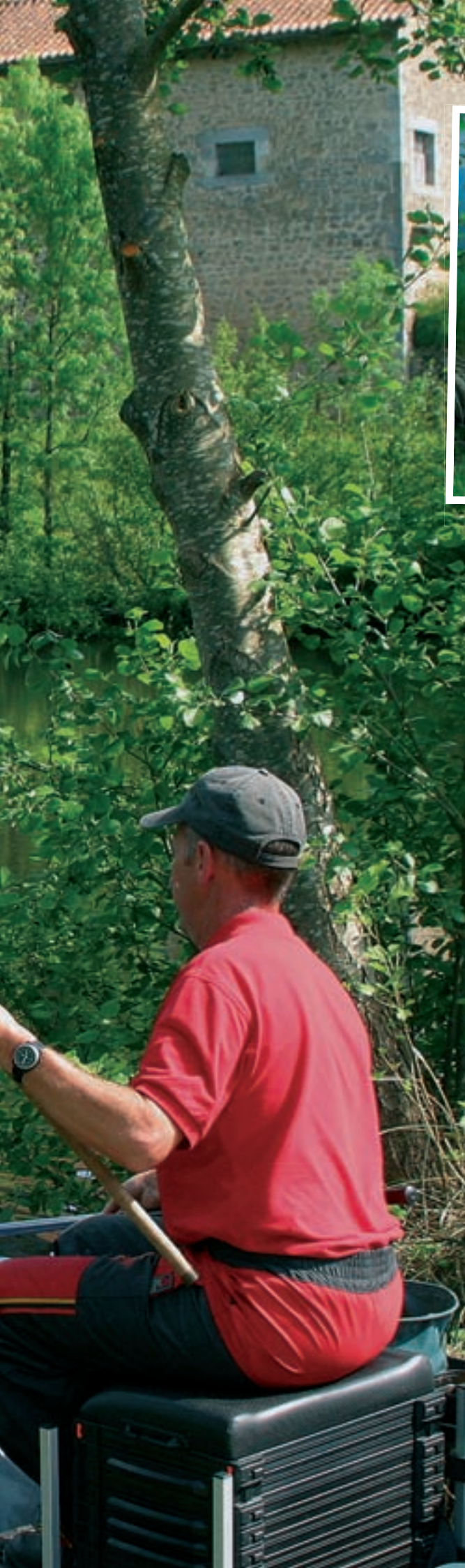
Polly showing off.